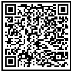
Usher/Elder Sign-up List 2025